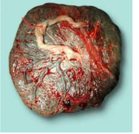
Maternal side of the placenta The maternal side of the placenta cobblestone surface

Send 10 mm<sup>2</sup> biopsy cut using a scalpel from near the cord insertion site